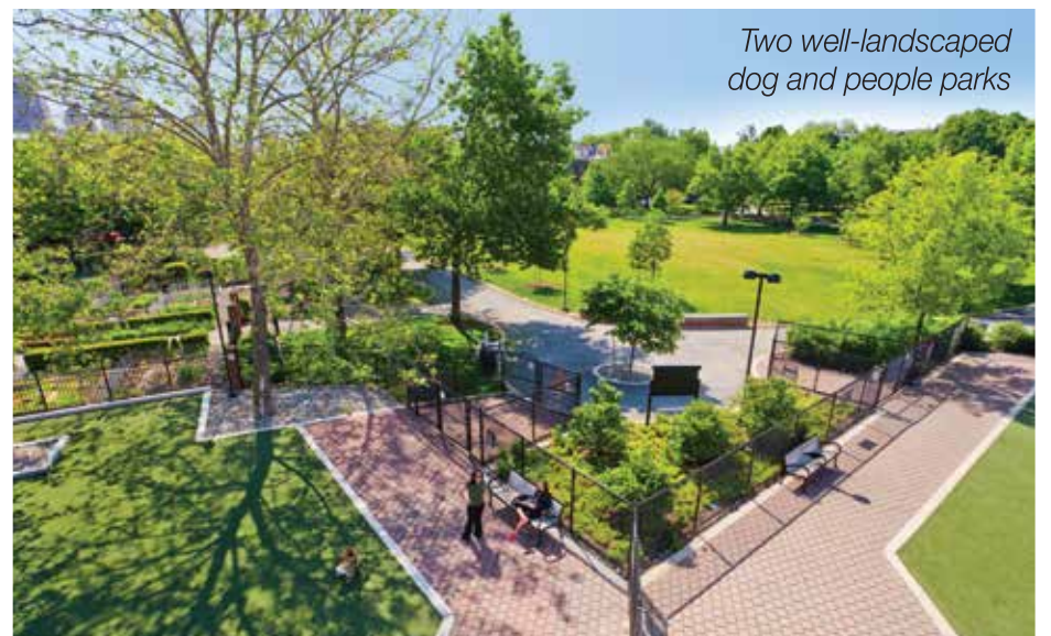
Two well-landscaped dog and people parks