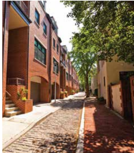
Charming cobblestoned streets of Fitler Square