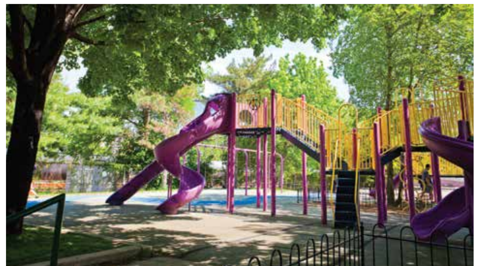
Taney Playground & Ballfields